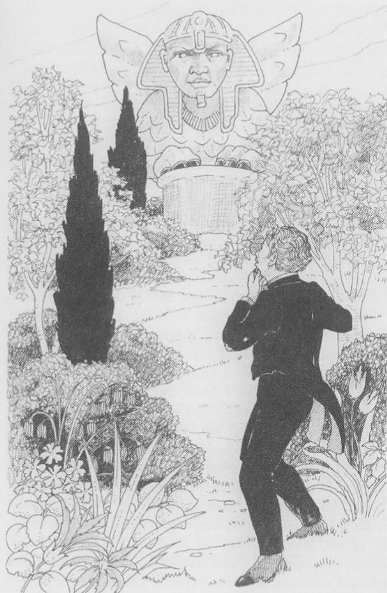
The Time Machine was nowhere to be seen.

'It is possible that the little people had put the machine in a safe place for me, but I didn't feel that they were either strong enough or caring enough to move it. This is what worried me, the feeling of a new power that had moved the machine. But where could it be?